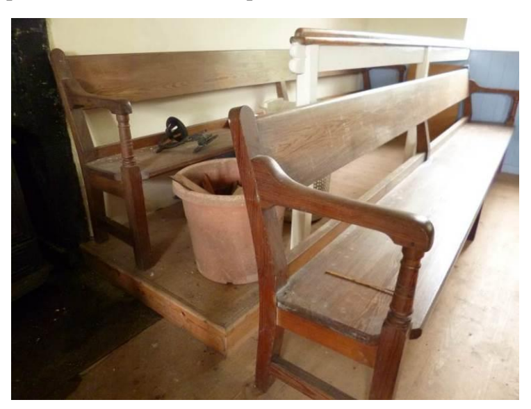
Fig.4: benches and rebuilt stand in the small meeting room

The meeting contains a set of historic pine benches; these have turned upper elements to the front legs and match benches in Cockermouth meeting house. There are also a few plainer benches with solid pine bench ends.