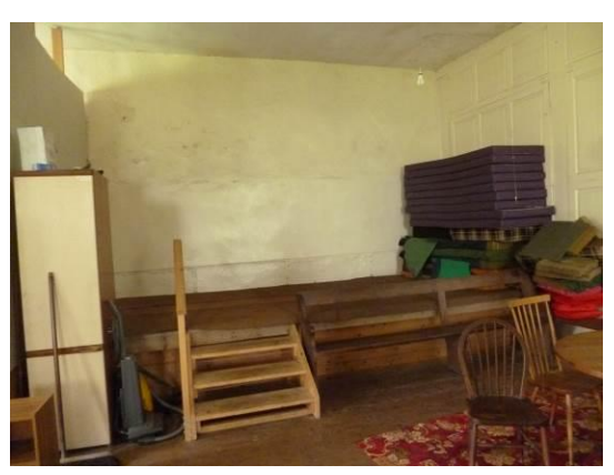
Statement of Significance

The Pardshaw meeting house complex includes the meeting house of 1729, stables of 1731 and school room of 1745. With the burial ground, the place has high heritage significance as a fine example of a meeting house developed in the first half of the eighteenth century, and associated with early Quakerism in rural West Cumbria. The buildings retain some original fittings although the large meeting room has been slightly altered. The quiet beauty of the rural setting enhances the significance of this place. The site's heritage significance is under threat from under-use, lack of funds and the deteriorating condition of the ancillary structures.