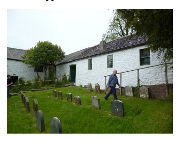
Fig.1: 1745 school room to right and 1731 Fig.2: stables (right) and school room from stables to left, from the east

Quakers met for worship in the open air on Pardshaw Crag (NY102256) from the 1650s until 1672. George Fox attended meetings here in 1657 and 1663. In winter, Friends also met in houses at Pardshaw, Lamplugh, Whinfell and Eaglesfield. In 1672, the meeting moved to a purpose-built meeting house close by; this has gone but Butler suggests it was in a field just west of the present meeting house complex. This first meeting house was extended in 1705, but replaced by the present L-plan building in 1729, built on a plot bought from Cuthbert Pierson for £18 in 1726. Friends re-used some of the building materials including the mullioned windows in the small meeting room. A burial ground was laid out around the same time. In 1731 a stable block was built between the meeting house and the lane; the door lintel dated 1672 is said to come from the first meeting house. In 1740, a porch was added to the small meeting room, when this was being used as a school. In 1745 a new school room was built next to the lane, with a covered passage separating it from the stable. John Dalton, the scientist (born in Eaglesfield, 1766), went to this school. A second detached school room was built next to the lane, north-east of the burial ground in 1774, later demolished. An open-fronted shed was built to shelter ten carriages, in 1879, across the lane opposite the stables.