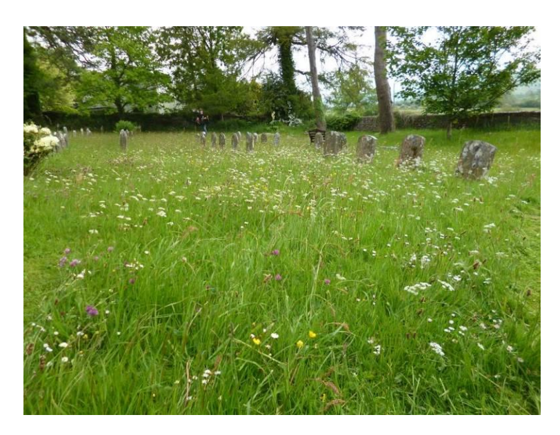
Fig.5: burial ground from the south-west

The burial ground has probably been in use since the 1730s, but the date of the earliest burial is not known. Headstones were not used here before c1850, according to Bradbury (p41). Plain headstones are arranged in rows, aligned north-east to south-west, with several patterns of headstone: plain semi-circular or segmental headed and some with moulded semi-circular heads. Bradbury published a sketch plan of the burial ground and a list of burials, compiled by Dave Moll, a Cockermouth Friend in 1997 (Bradbury, 1998, pp112-117).